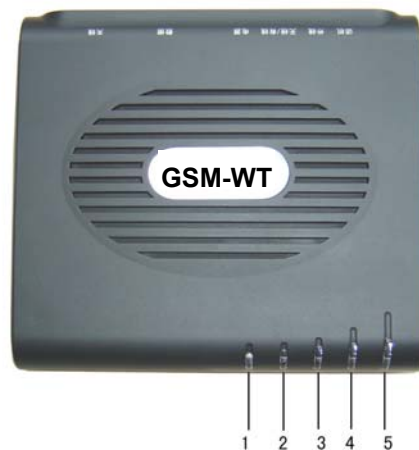
Map 1 Mains frontal map